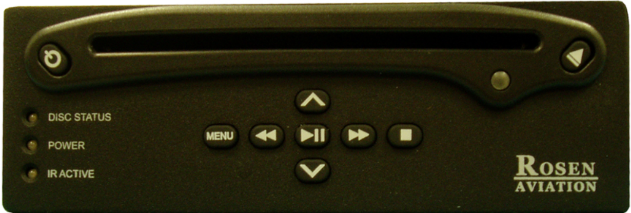
Figure 1 Rosen DVD Player front case showing LEDs and control buttons